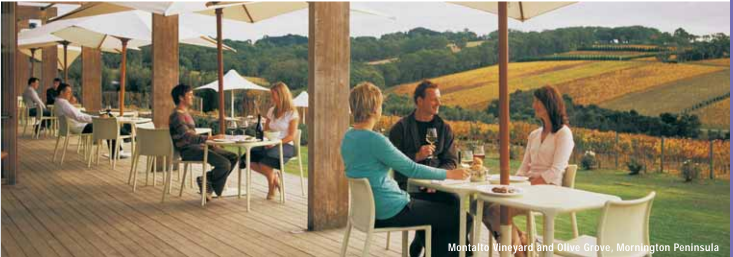
Montalto Vineyard and Olive Grove, Mornington Peninsula